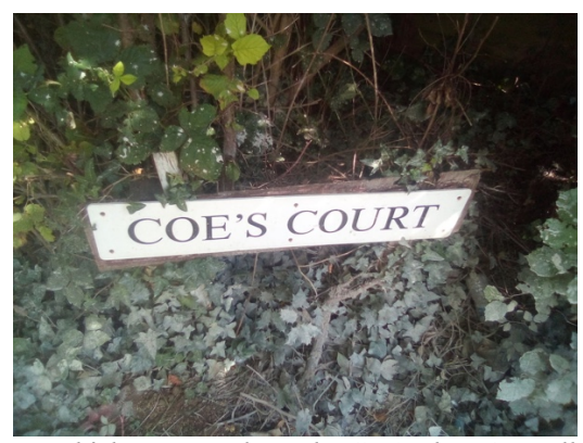
Coe's Court which now stands on the Coe's shop & small holding.