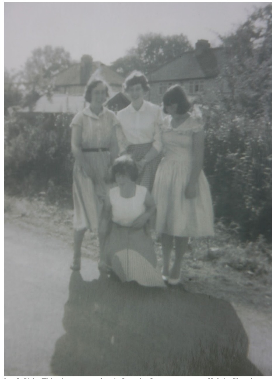
Our Mum with her 3 Girls. This picture was taken in Laundry Lane, you can see Kelvin Close houses in the background.

Post-war, money was tight, but as a child, it seemed to be a happy community. At the back of the row of cottages, we all had back gardens and to the side of the houses was a plot of land which was turned into allotments for growing vegetables. There was also a well on this piece of land.