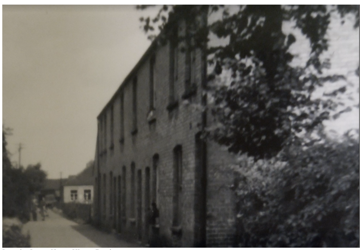
Laundry Lane, Cherry Hinton Road

*All photographs included here are Penny's unless otherwise stated.